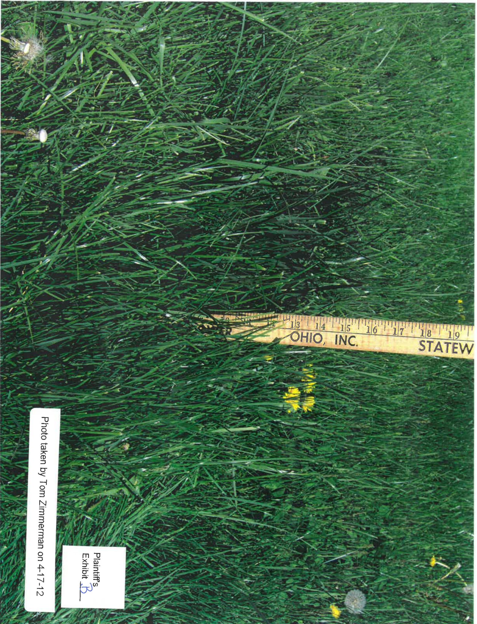
on 4-17-12